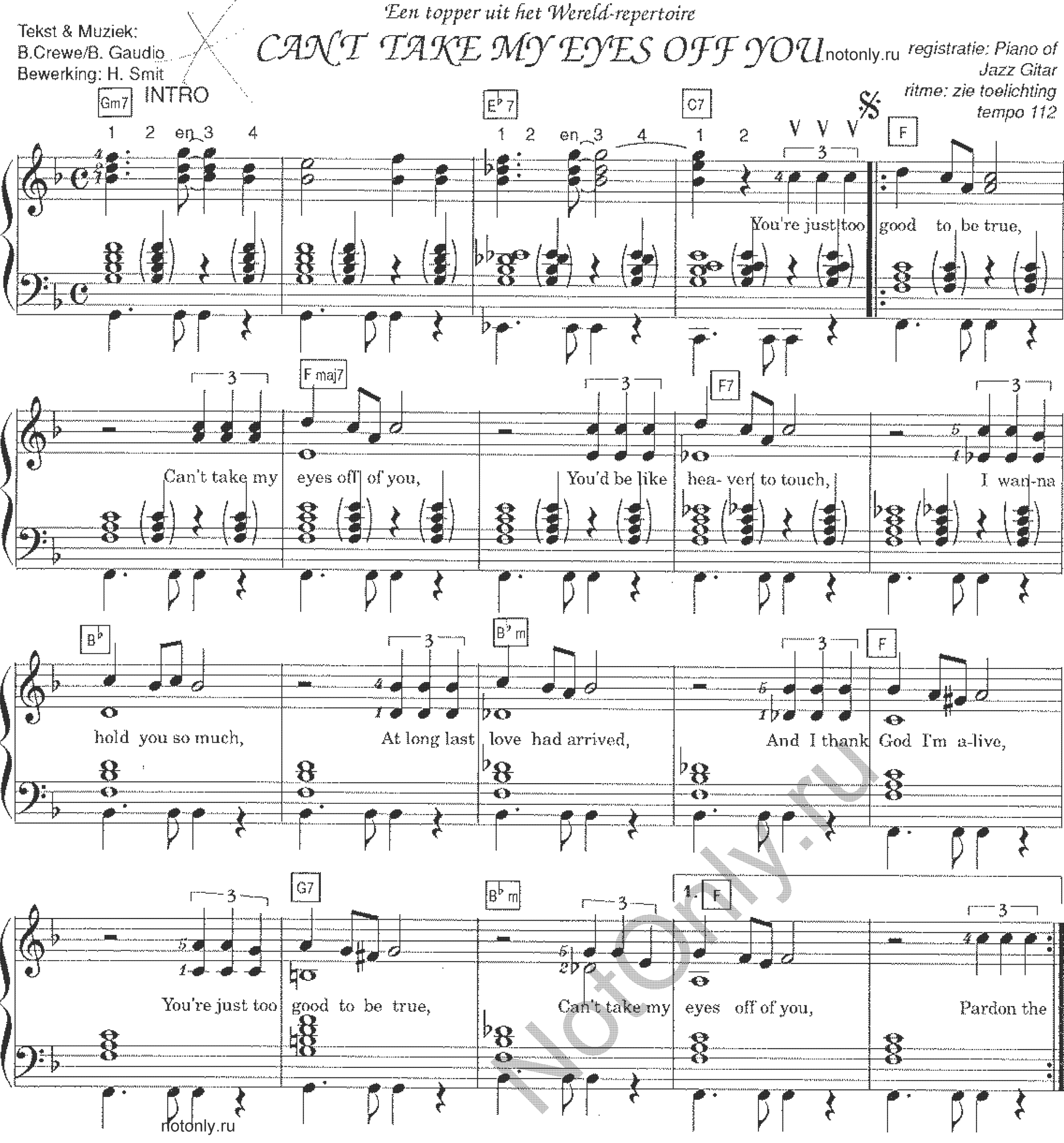
© 1967 by Saterday Music Inc. and Seasons Four Music Corp. New York. Voor Nederland: EMI Music Publishing Holland B.V., Hilversum. 14